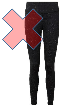
Black leggings ( worn with normal uniform )