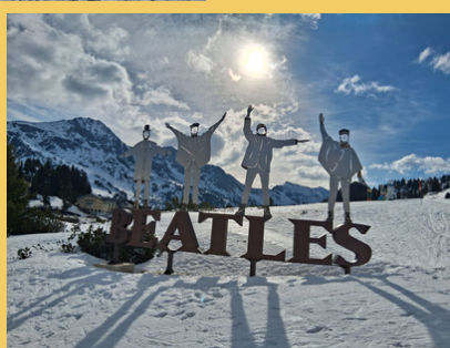
All of the photographs can be found on our website under the newsletters section.