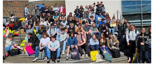
Year 12s planning their next steps at

The events will be held in the Telfer Dining Hall.