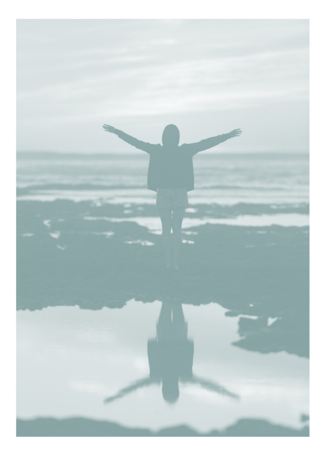
The Open Door ICE Project aims to Inspire, Champion and Equip children and young people to reach their full potential.