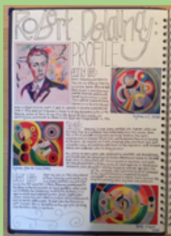
AO3: Observation and development