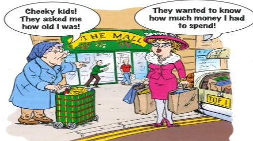
B - How to upset people

Think up good question for a questionnaire needs skill and care. You must not ask questions that can cause offence, like the students in B . without the help of other people no useful information can be collected.