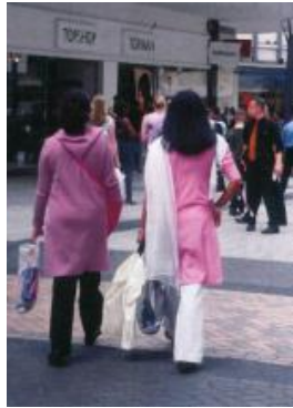
A - People in Birmingham City centre