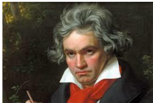
Ludwig van Beethoven German Composer

PIANO SONATA – piece of music for solo piano. Beethoven wrote 32 piano sonatas