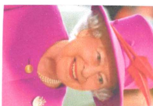
Queen ELIZABETH II