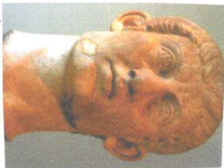
Roman Emperor CONSTANTINE

How did Britain come to be regarded as Christian?