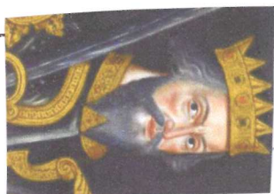
WILLIAM the Conqueror