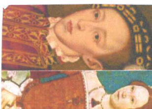
King EDWARD VI → Queen MARY I → Queen ELIZABETH I