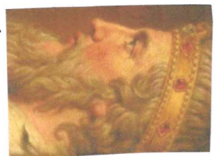
ALFRED, the Christian King of Wessex