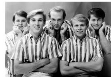
The Beach Boys