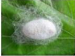
Silk Worm Cocoon

As each cocoon is very small, silk fabric is very expensive as it takes so much effort to make just one item – it takes around 1,800 cocoons to make one silk dress! Silk is quite a delicate fabric and can be easily damaged when it's wet (eg washing). Silk is often used for special items like wedding dresses, or special occasion shirts or ties but some people have silk underwear! Silk keeps you cool when it's hot, and also keeps you warm when it's cold. It has a natural 'lustre' or shine.