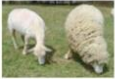
Before and after shearing!

Wool is a fibre that comes from animals. We mostly get wool from sheep, but you can also get wool from camels, alpacas, llamas, goats and even rabbits! It's possible to make wool from anything that is hairy – you could even make wool fabric from a dog!