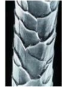
Wool fibre under a microscope

Felted fabric is made directly from the fibres. No spinning is needed, although the fibres are still washed and carded. Wool is one of the best natural fibres to create felted fabric, because each fibre has a scaly structure that looks a bit like a fir-cone. When the fibres are heated up, the scales open up and then lock together with other fibres when they are agitated (rubbed together).