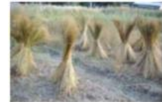
Flax plant drying after cutting