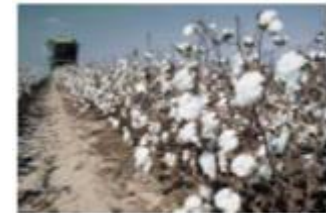
Field of Cotton plants